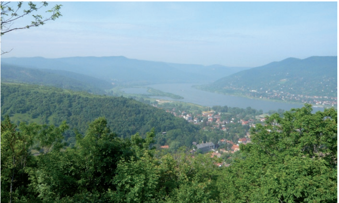
Figure 2: Danube river at Visegrád.

Katja Wendler, Thomas Track DECHEMA e.V., Frankfurt am Main, Germany