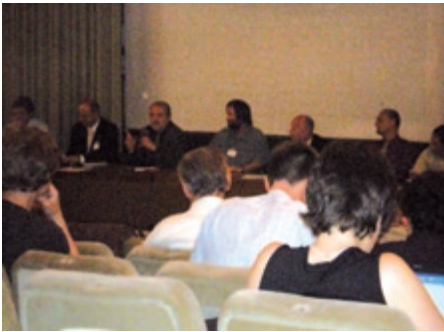
Figure 3: Overview of the discussion during the Workshop.

In May 2008 this 2 nd thematic WP1b Workshop “ Bridging Science, Water Management and Practical Experiences in European River Basins ” was organized in Budapest, Hungary, by CSIC (Spain) in collaboration with TNO (The Netherlands), DECHEMA (Germany) and VITUKI (Hungary). The event was sponsored by the EU through the CA RISKBASE and UNESCO (Italy), which also funded the best poster award delivered at the workshop closure.