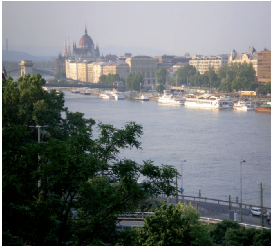
Figure 4: View of Danube at Budapest (Photo: CSIC).

Damià Barceló, Silvia Díaz-Cruz, Rosa Mari Darbra CSIC, Barcelona, Spain